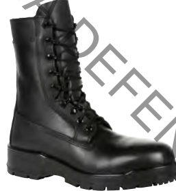
General Purpose // RKC090 // p.8