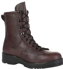
NAVAIR // 0708 // p.8