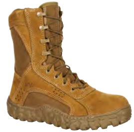
S2V Protective Toe // 6104 // p.8