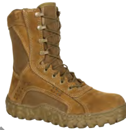
S2V // 104 // p.5