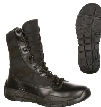
C4T // RY008 // 8"

M/W 4-15 Whole Sizes Only LP0058R | MSRP $109