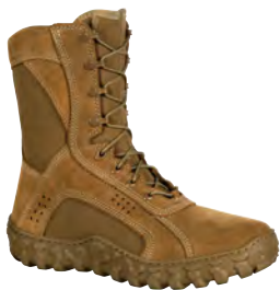
S2V // RKC050 // p.5