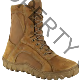
S2V Insulated // RKC055 // p.6