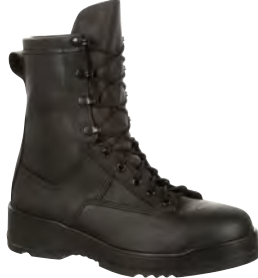
Flight Deck // RKC058 // p.8