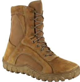
S2V Insulated // RKC055 // p.6