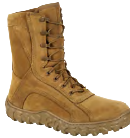
S2V // RKC080 // p.5