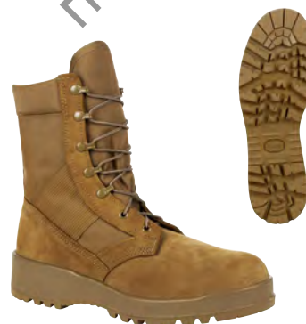
Entry Level - Hot Weather // RKC057 // 8"

M/W 4-15 Half sizes up to 14 LP0096R | MSRP $155