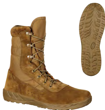
C7 // RKC065 // 8"

M/W 4-15 Half sizes up to 14 LP0079R | MSRP $154