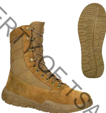
C4R // RKC087 // 8"

M/W 4-15 Half sizes up to 14 LP0138R | MSRP $224