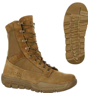
RLW // RKC042 // 8"

M/W 4-15 Half sizes up to 14 LP0088R | MSRP $149