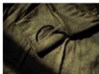
Thumb hole detail