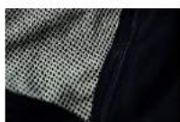
Wool mesh lined