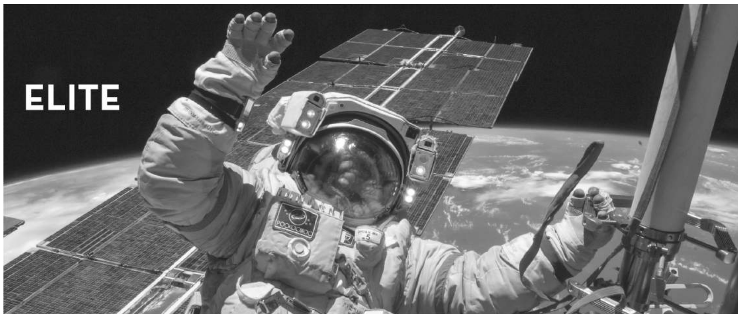
NASA. Testing our Cobra top on the International Space Station.

Elite is high performance protective wear engineered exclusively for professionals who demand the very best. These new and innovative fabrics were developed in Italy using compact® spun yarns that offer a smooth, silken feel whilst retaining incredible strength and abrasion resistance. Tested for intense activity under extreme conditions, the Elite Range has an athletic fit, designed to look great as you space walk or when you're out on the town.